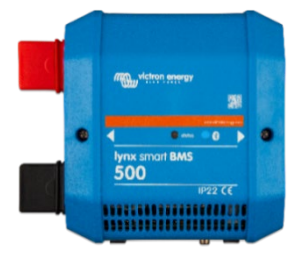
Lynx Smart BMS