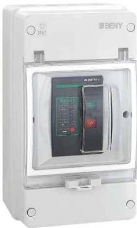
BDM-125 with IP65 Enclosure